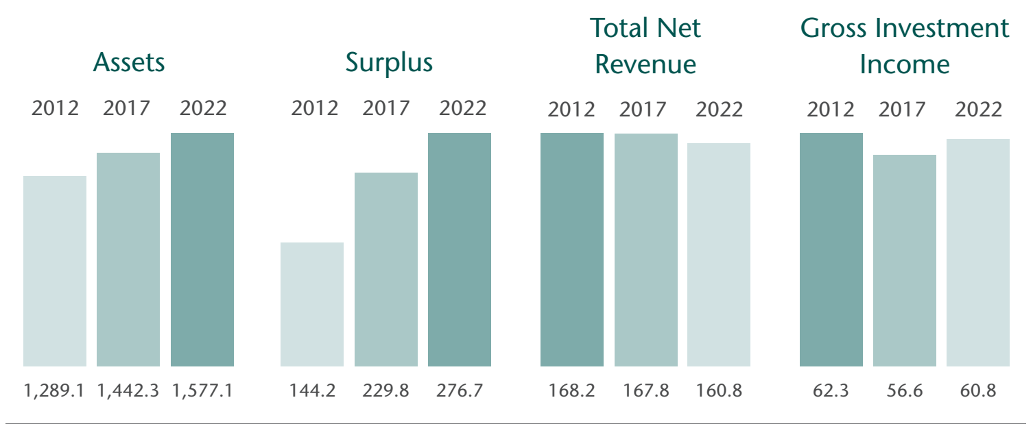
Chart represents dollars in millions